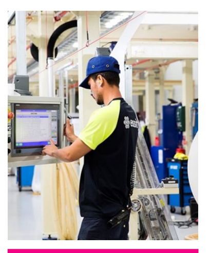
Digitalization in Operations