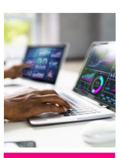
Data Analytics & Capabilities